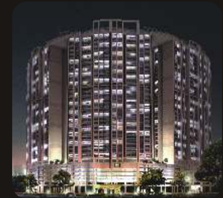
Runwal Elegante Lokhandwala, Andheri (W)