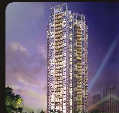
The Reserve Next to Four Seasons, Worli