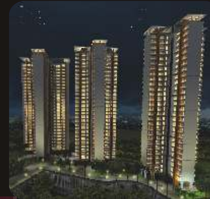
Runwal Anthurium Next to R Mall, Mulund (W)