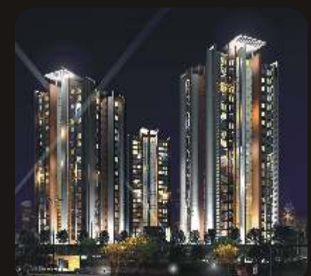
Runwal Pearl Ghodbunder Rd., Thane (W)